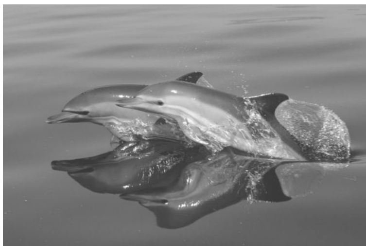
Fig. 1. Two common dolphins photographed in the eastern Ionian Sea show the characteristic morphology of the species: bright coloration, short beak, narrow dark flipper stripe, occasional white patch in dorsal fin.

The short-beaked common dolphin Delphinus delphis Linnaeus 1758 (Fig. 1) is a small cetacean species with a wide distribution. Like most other cetaceans, however, it occurs as a series of geographically separate populations (Heyning & Perrin, 1994; Perrin & Brownell, 1994; Jefferson & Van Waerebeek, 2002). On a global scale, the systematics and zoogeography of the genus Delphinus are subjects of ongoing investigation (e.g. Jefferson & Van Waerebeek, 2002). At present, two species are recognised: the short-beaked common dolphin D. delphis and the long-beaked common dolphin D. capensis (Heyning & Perrin, 1994; Rosel et al., 1994). Only short-beaked common dolphins inhabit the Mediterranean Sea and adjacent water bodies, and therefore throughout this Plan references to 'common dolphins' can be understood to mean this species.