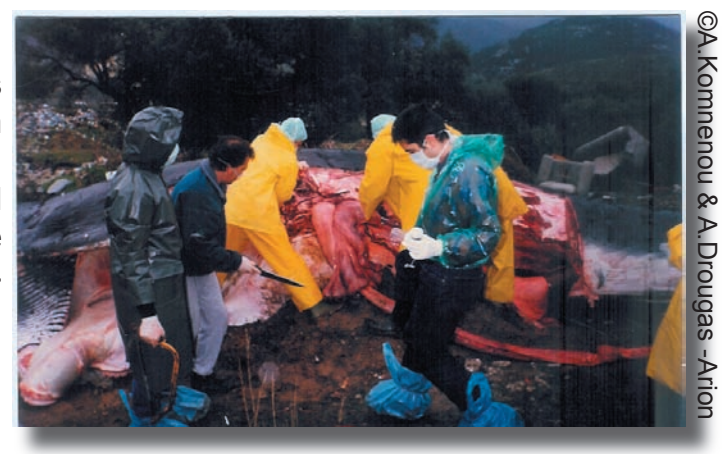
Plastic cloths can be useful to perform necropsies, when disposable clothes are not available

Fixation and storage: samples should be placed as soon as possible at 4°C. If they cannot be transported to a specialised laboratory within 24 h, they should be frozen (ideally at -80°C).